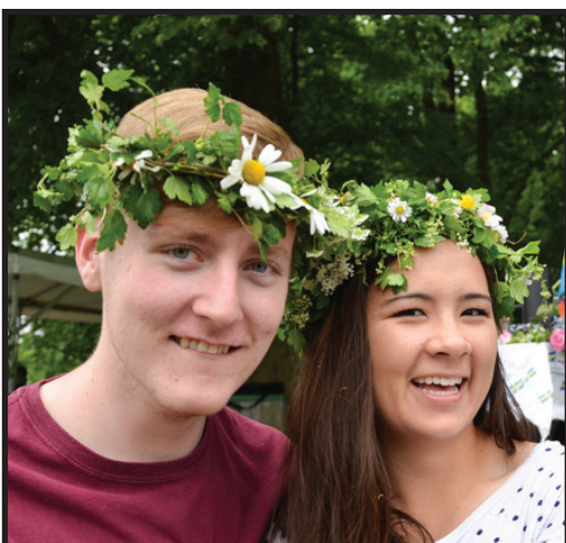
Midsummer celebrations in Hammarskog