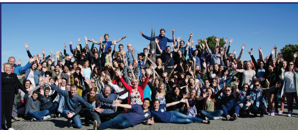
Students, teachers and staff during the third session