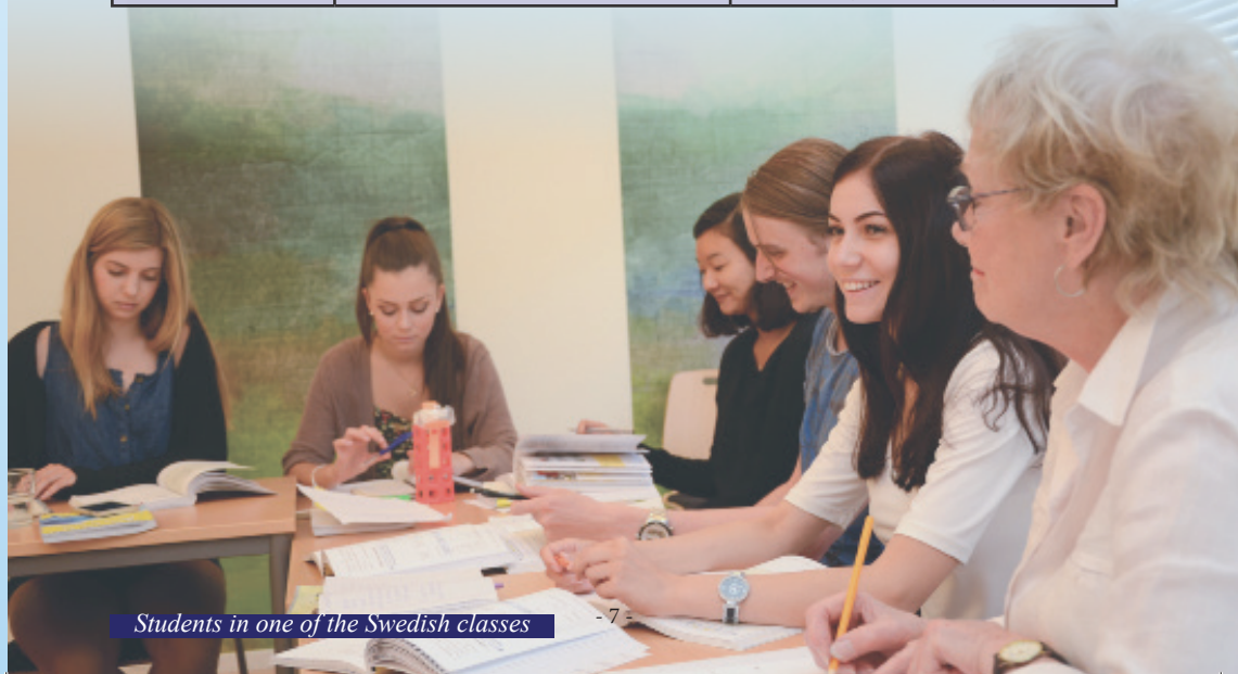
Students in one of the Swedish classes