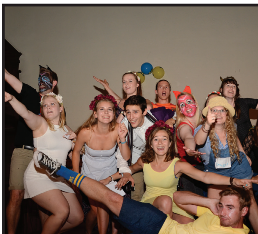
Students performing at the farewell dinner themed 'Typically Swedish'