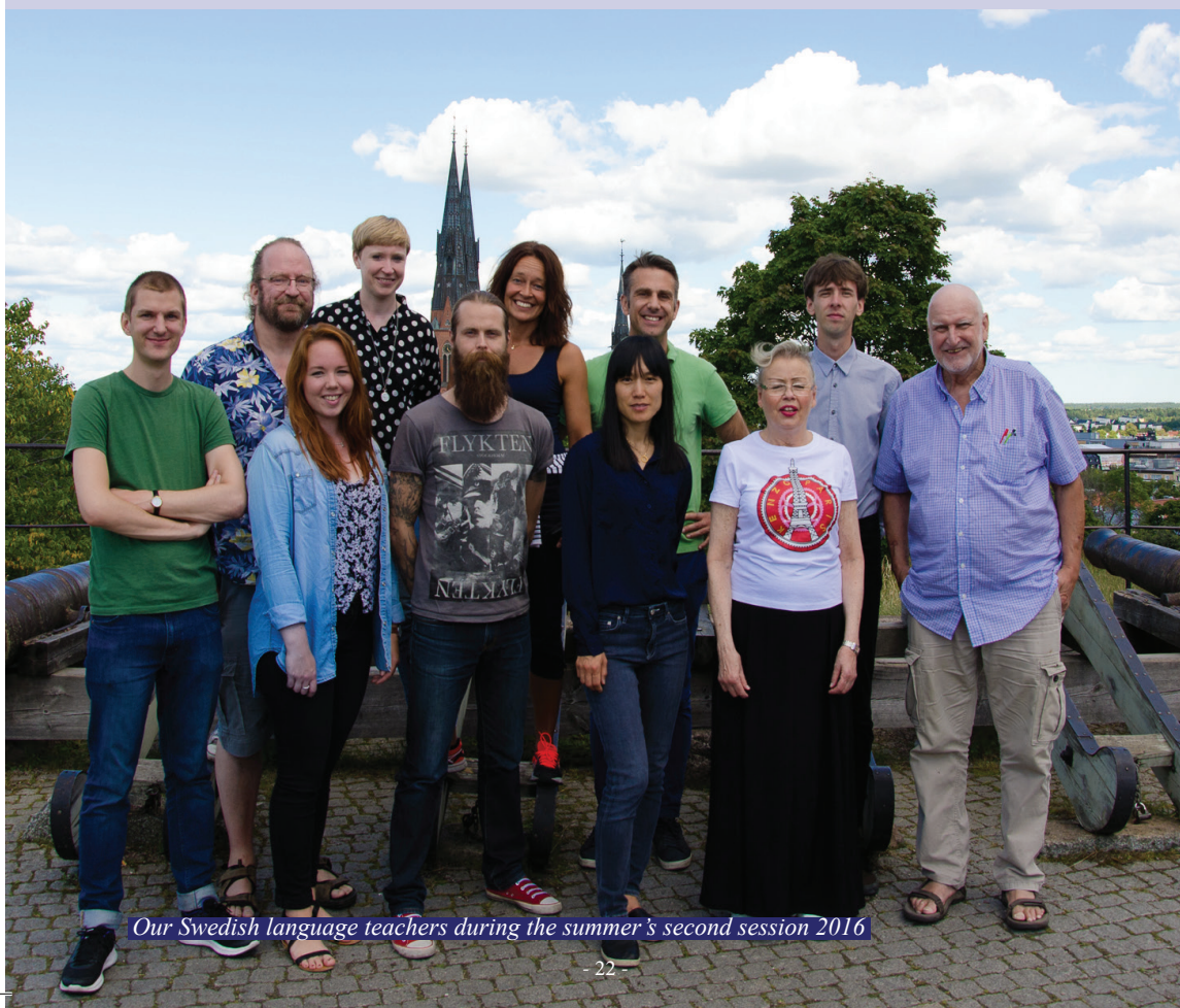
Our Swedish language teachers during the summer's second session 2016

Phone: +46 70 437 58 66 Email: director@uiss.org