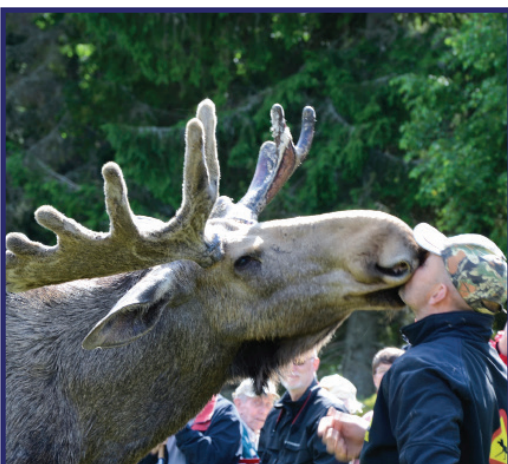
Fieldtrip to Gårdsjö Älgpark, watching the owner get kissed by his moose friend