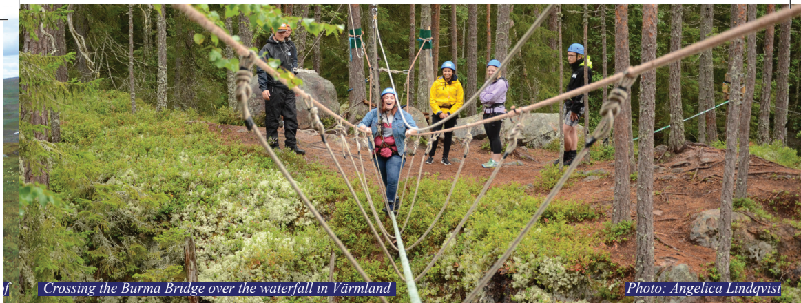
Crossing the Burma Bridge over the waterfall in Värmland