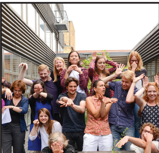
The drama class being... dramatic.