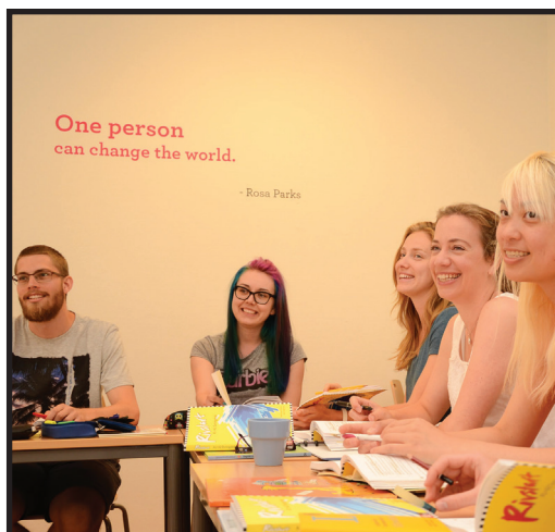
Students in one of our Swedish classes