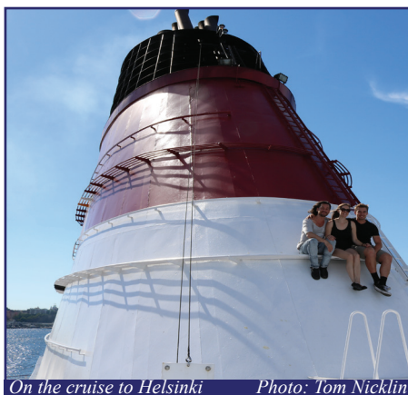
On the cruise to Helsinki

In order to reserve a place on this trip please mark it down on the application form and pay the non-refundable deposit of 1000 SEK.