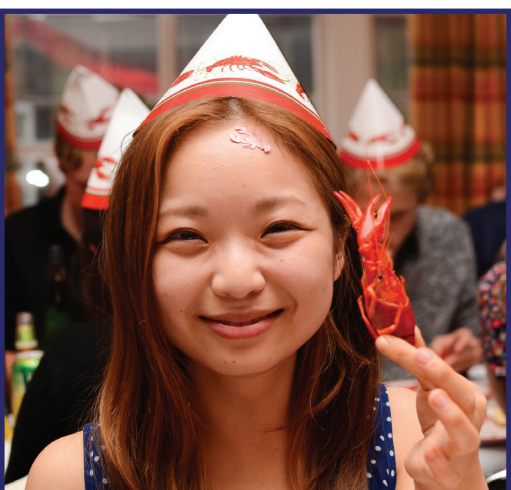
The traditional UISS crayfish dinner