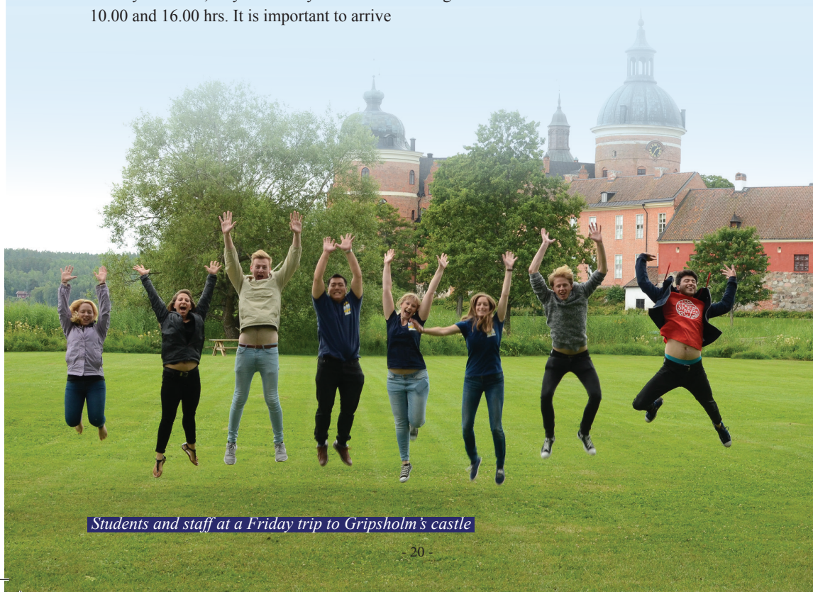
Students and staff at a Friday trip to Gripsholm's castle

Fridays July 7, July 28 and August 18 between 10.00 and 13.00 hours. Please book a flight that leaves after the check-out.