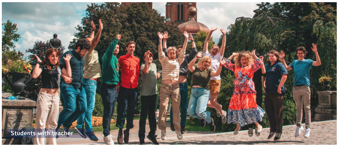
Students with teacher