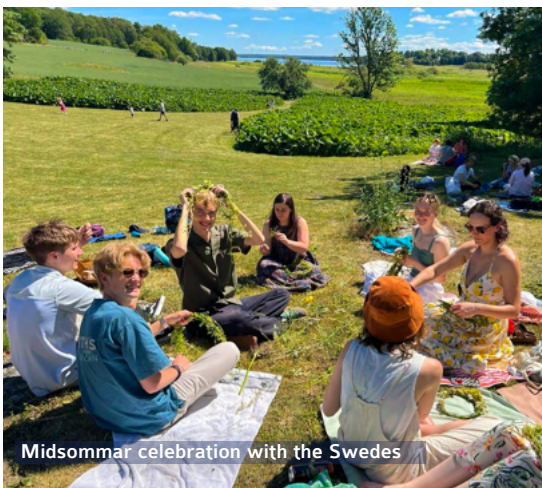
Midssommar celebration with the Swedes