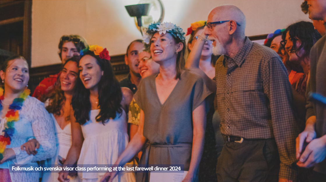
Folkmusik och svenska visor class performing at the last farewell dinner 2024