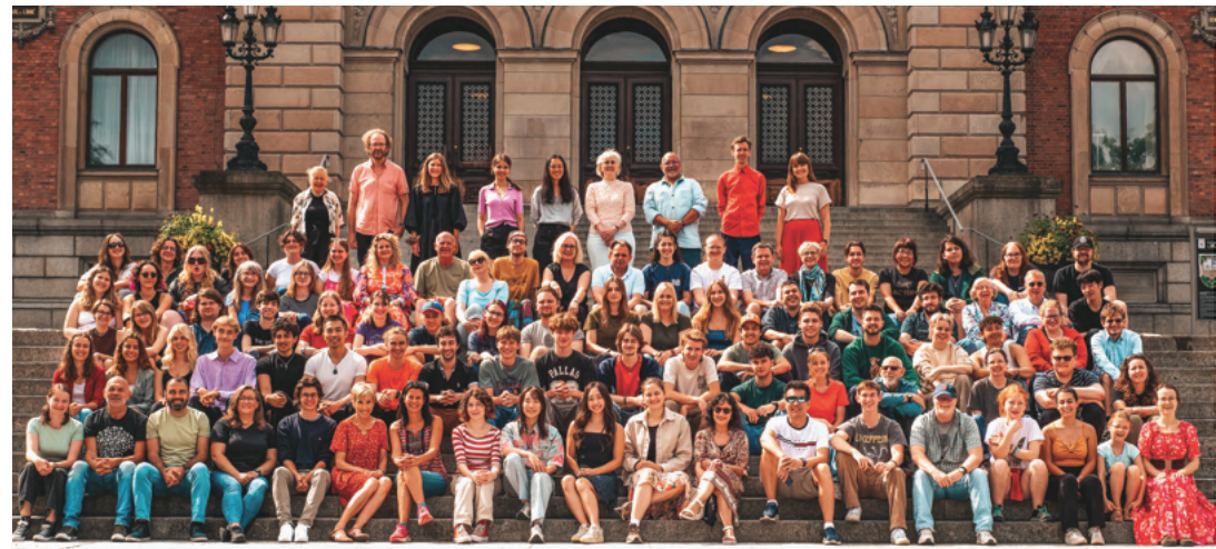
Teachers and students from 37 different countries