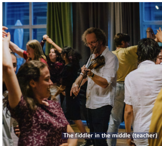
The fiddler in the middle (teacher)