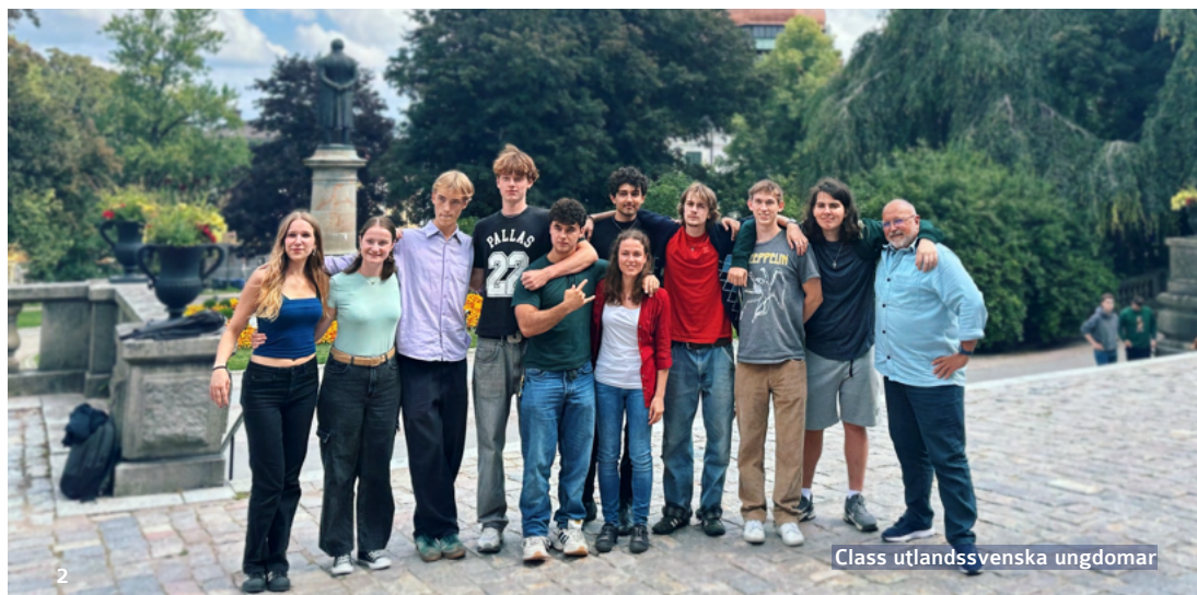
Class utlandssvenska ungdomar