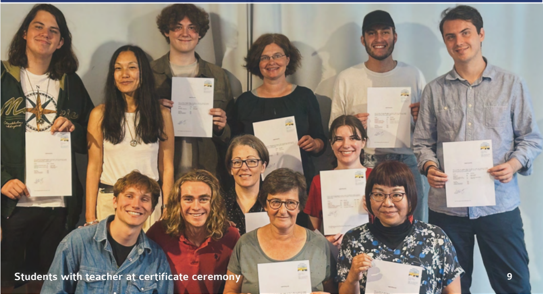
Students with teacher at certificate ceremony

If you have studied Swedish on your own, without any teacher guidance, then please inform the director of this when sending the test results.