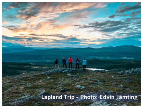
Lapland Trip

Please bring: Sleeping bag warm enough for temperatures around freezing point, pad, hiking clothing (shoes, rain gear) strong, real hiking backpack. If you cannot take a sleeping bag and pad, you'll be able to rent these for +/- 600 SEK.