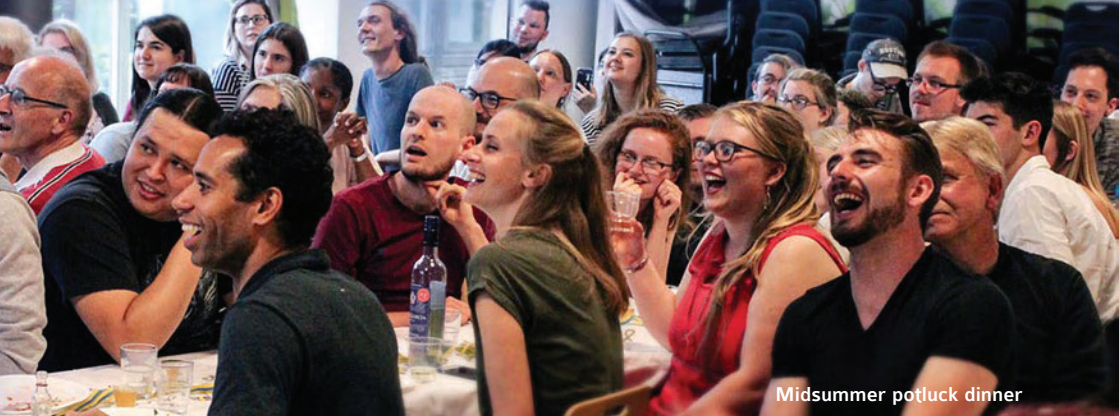
Midsummer potluck dinner