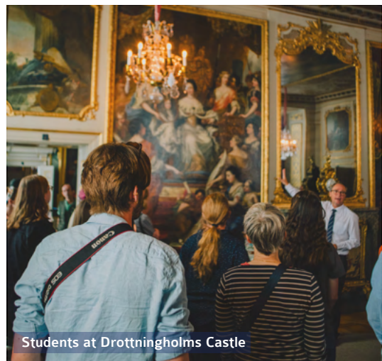
Students at Drottningholms Castle