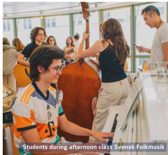
Students during afternoon class Svensk Folkmusik