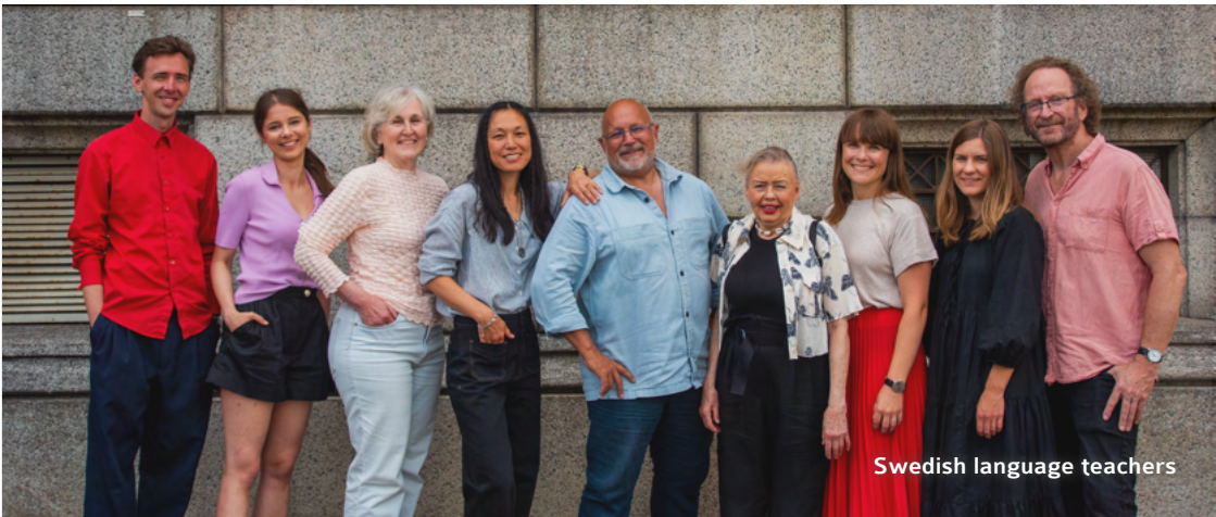
Swedish language teachers