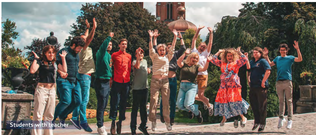
Students with teacher