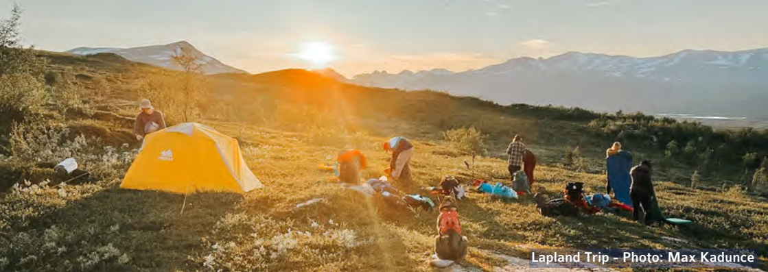
Lapland Trip