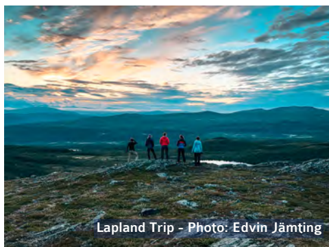
Lapland Trip - Photo: Edvin Jämting

Please bring: Sleeping bag warm enough for temperatures around freezing point, pad, hiking clothing (shoes, rain gear) strong, real hiking backpack. If you cannot take a sleeping bag and pad, you'll be able to rent these for +/- 600 SEK.