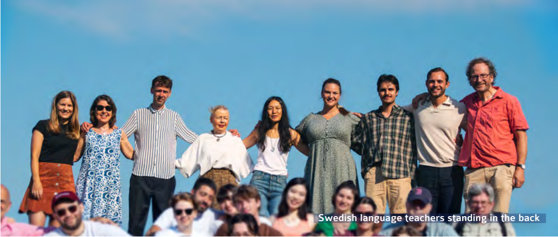
Swedish language teachers standing in the back