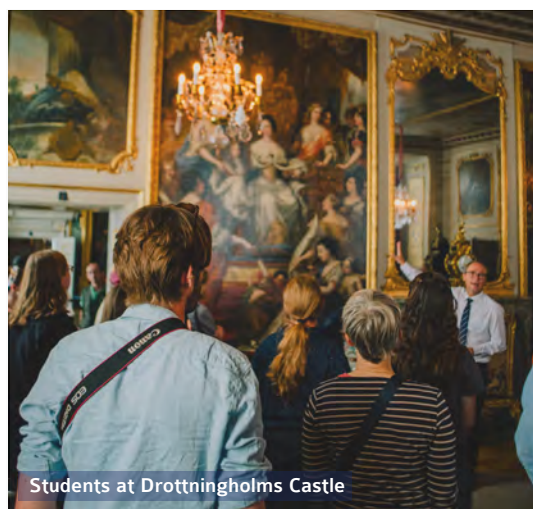
Students at Drottningholms Castle