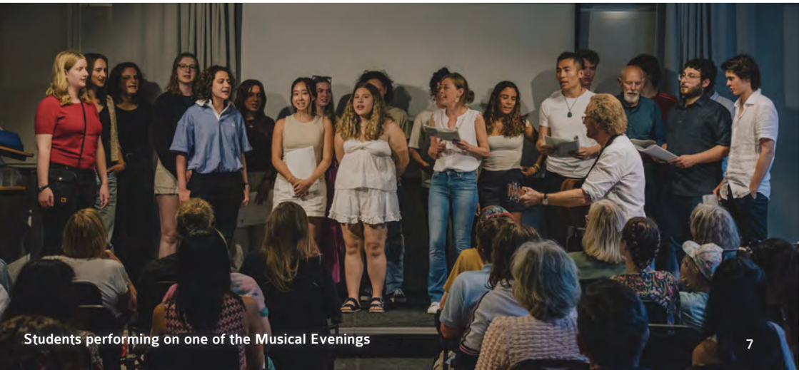
Students performing on one of the Musical Evenings

* Pay attention to the title of the course. Is it in Swedish? Then the class will be taught in Swedish, too! Make sure you have the right level for it before you sign up