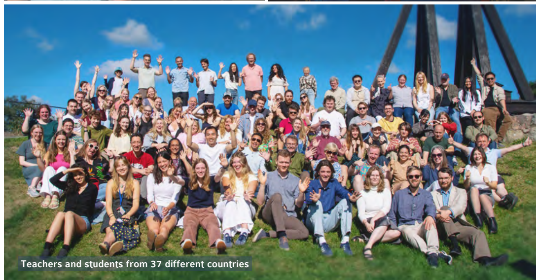
Teachers and students from 37 different countries