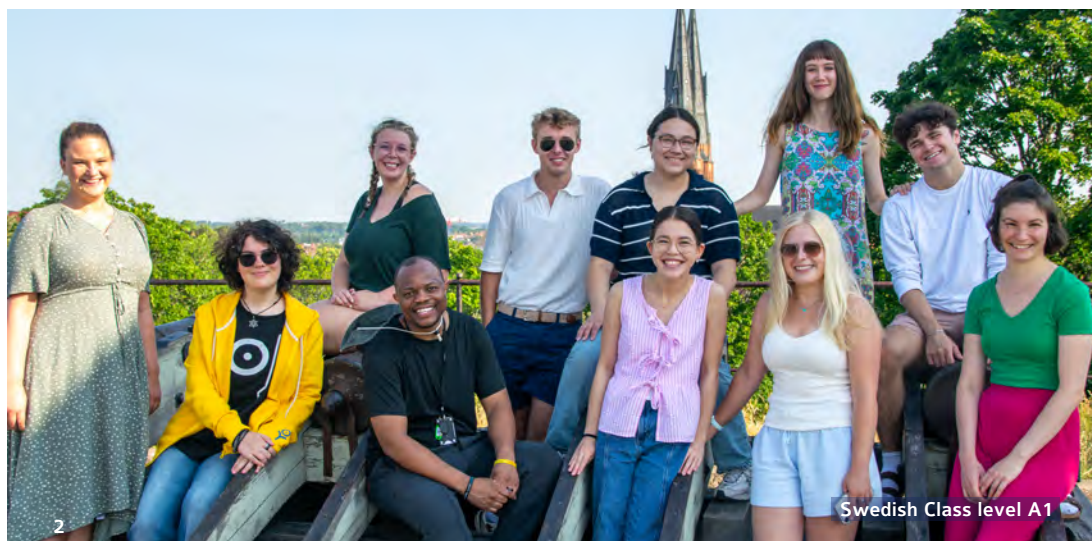
Swedish Class level A1