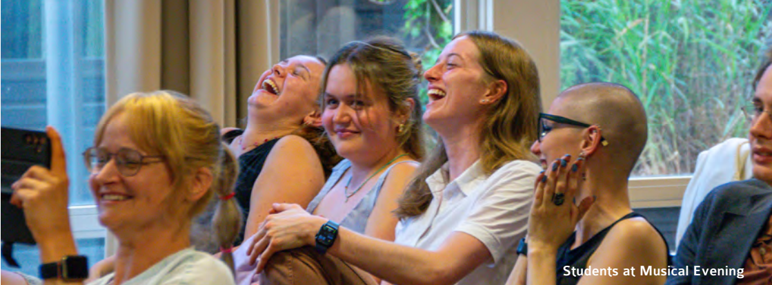
Students at Musical Evening