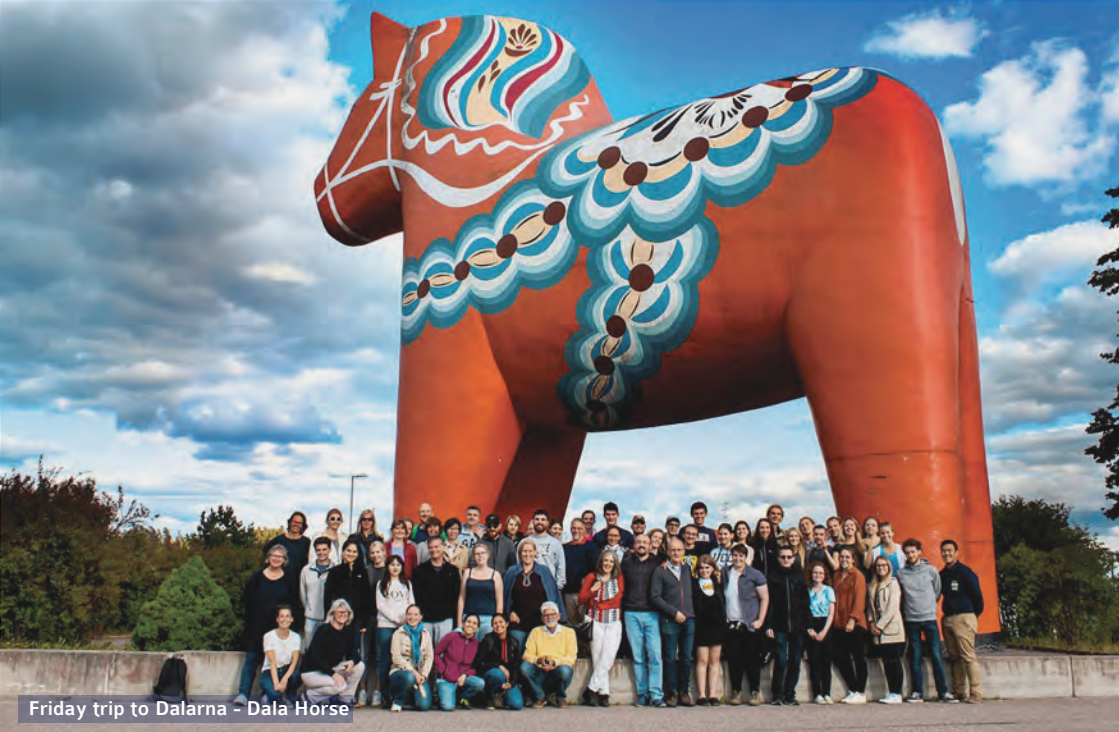
Friday trip to Dalarna - Dala Horse