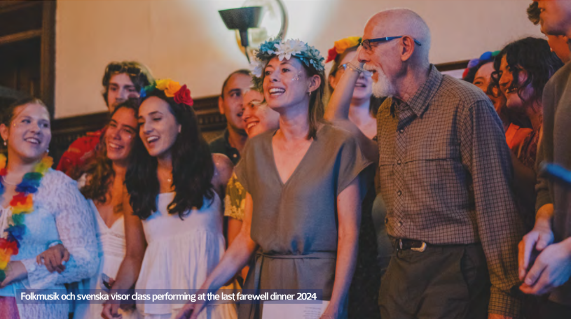
Folkmusik och svenska visor class performing at the last farewell dinner 2024