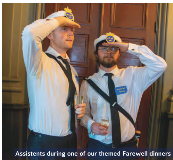
Assistants during one of our themed Farewell dinners