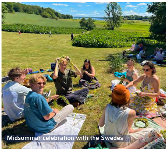
Midsummer celebration with the Swedes