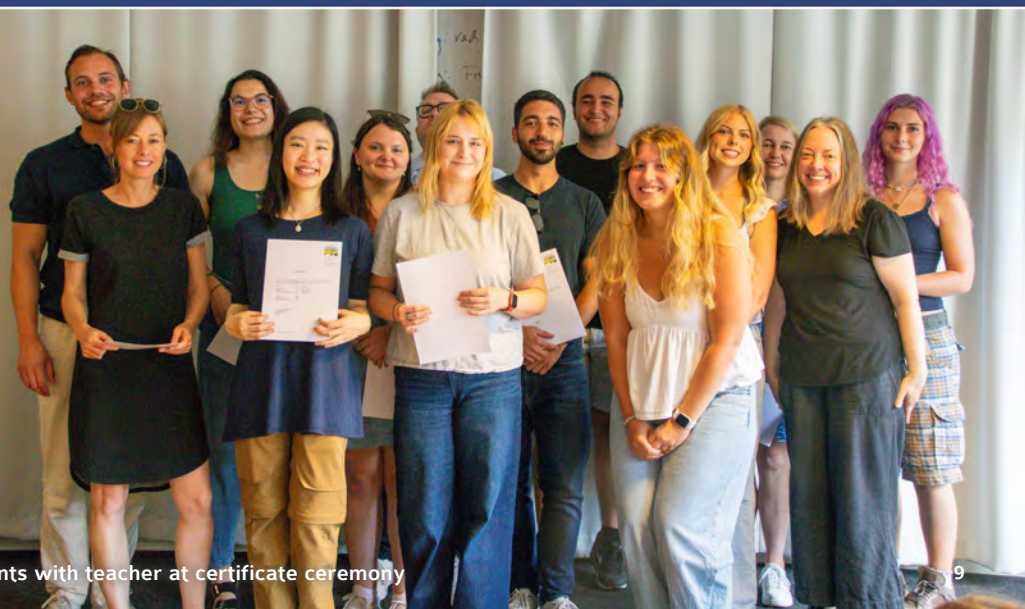
Students with teacher at certificate ceremony

If you have studied Swedish on your own, without any teacher guidance, then please inform the director of this when sending the test results.