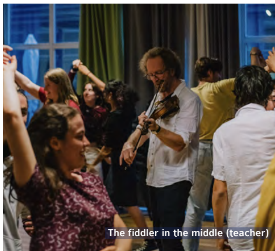
The fiddler in the middle (teacher)