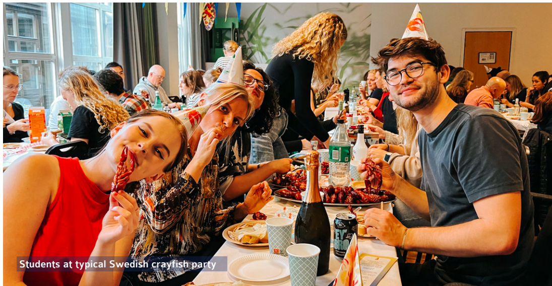
Students at typical Swedish crayfish party