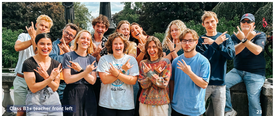
Class B1+ teacher front left