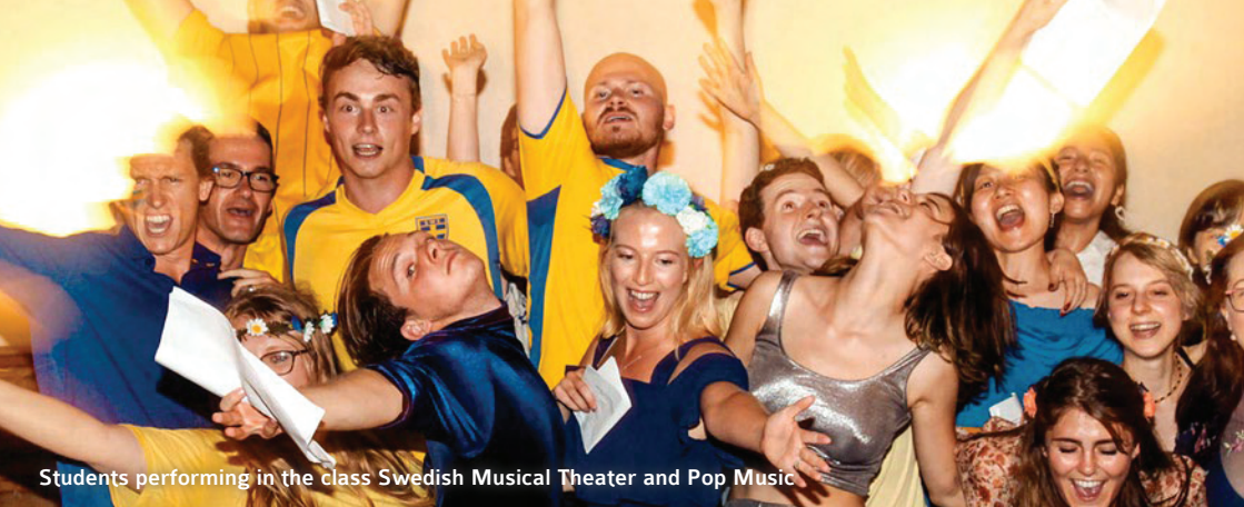
Students performing in the class Swedish Musical Theater and Pop Music