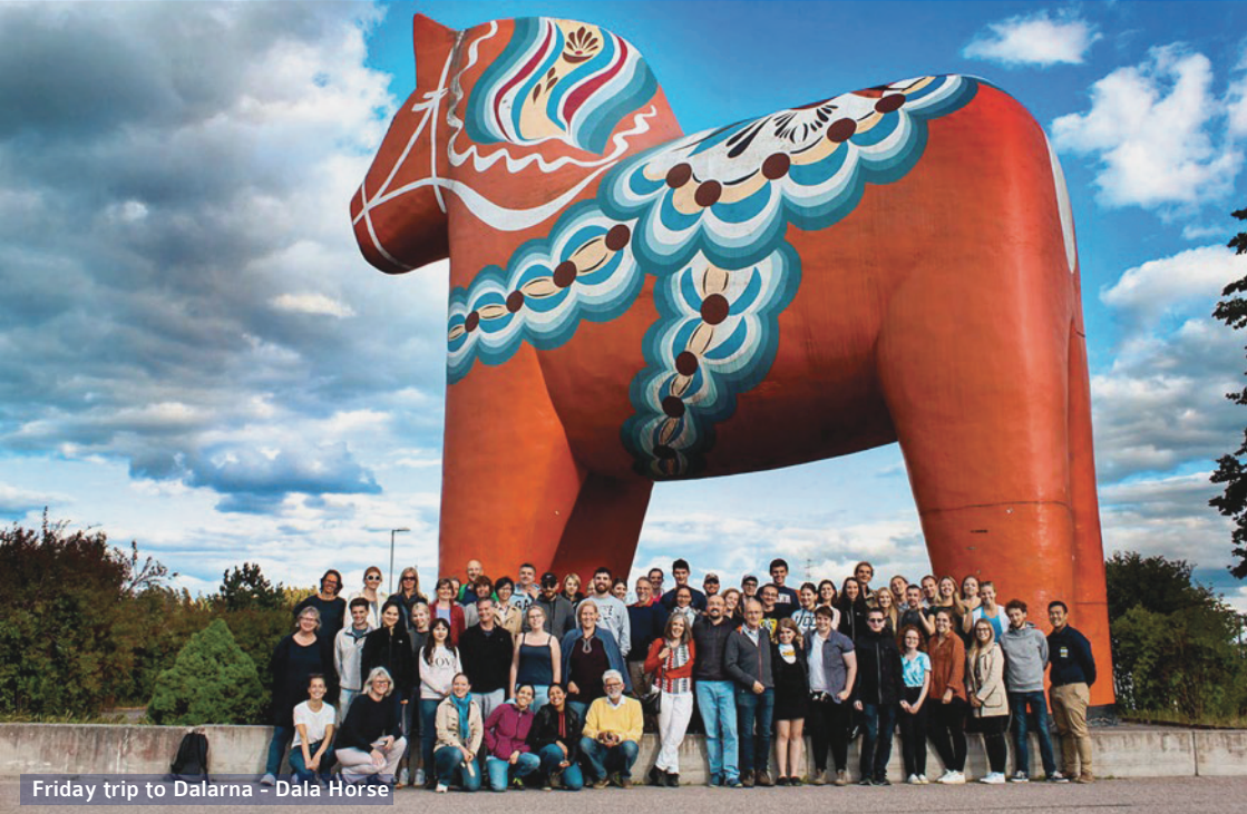
Friday trip to Dalarna - Dala Horse