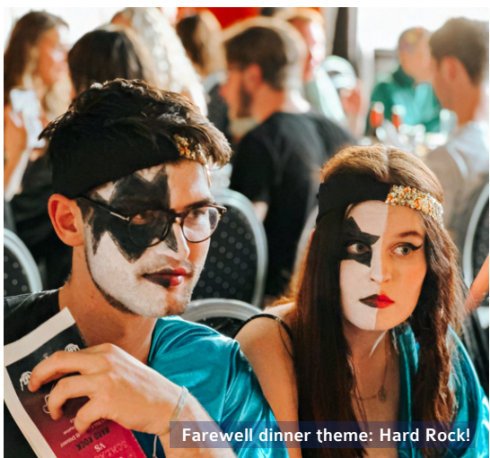
Farewell dinner theme: Hard Rock!