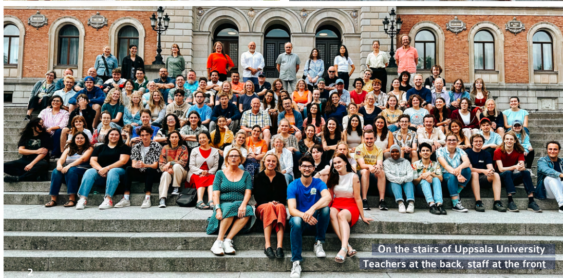
On the stairs of Uppsala University Teachers at the back, staff at the front