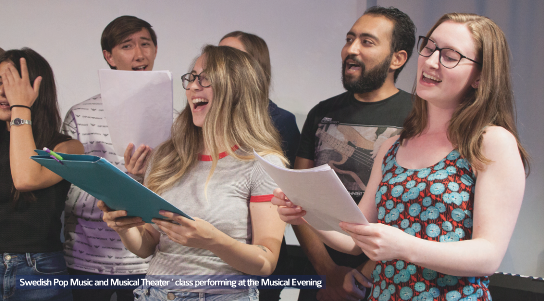
Swedish Pop Music and Musical Theater' class performing at the Musical Evening