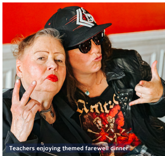
Teachers enjoying themed farewell dinner