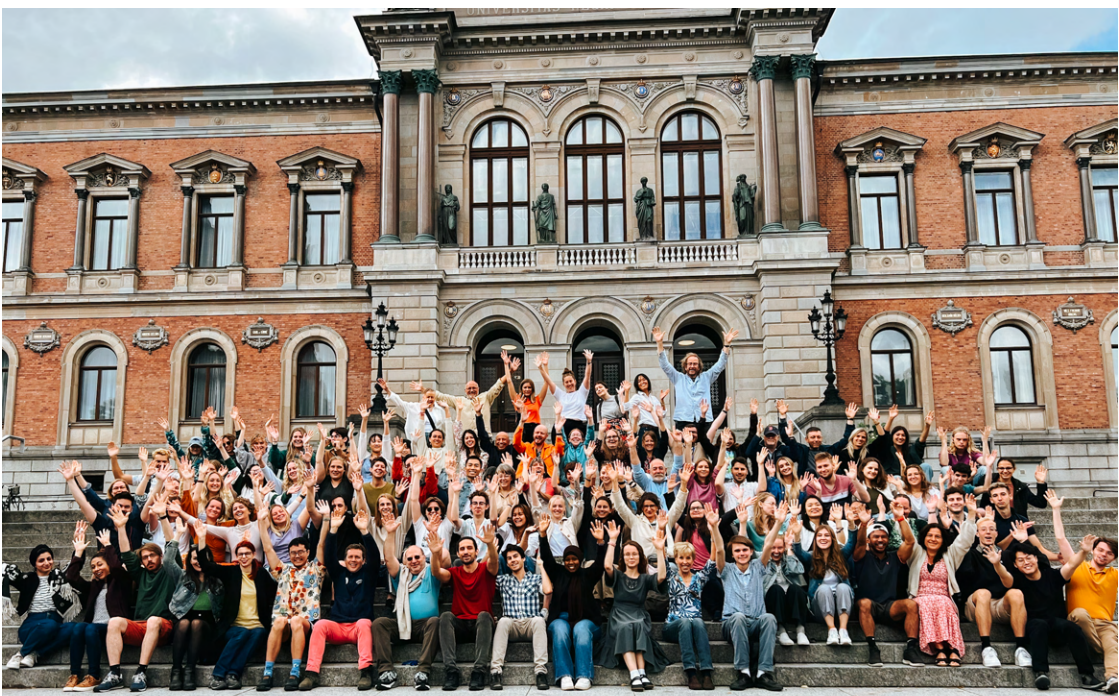
22 Staff, teachers and students from 37 different countries

Mailing address: Uppsala International Summer Session Box 15 100 SE-750 15 Uppsala, Sweden