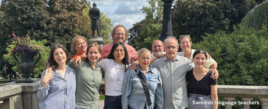
Swedish language teachers